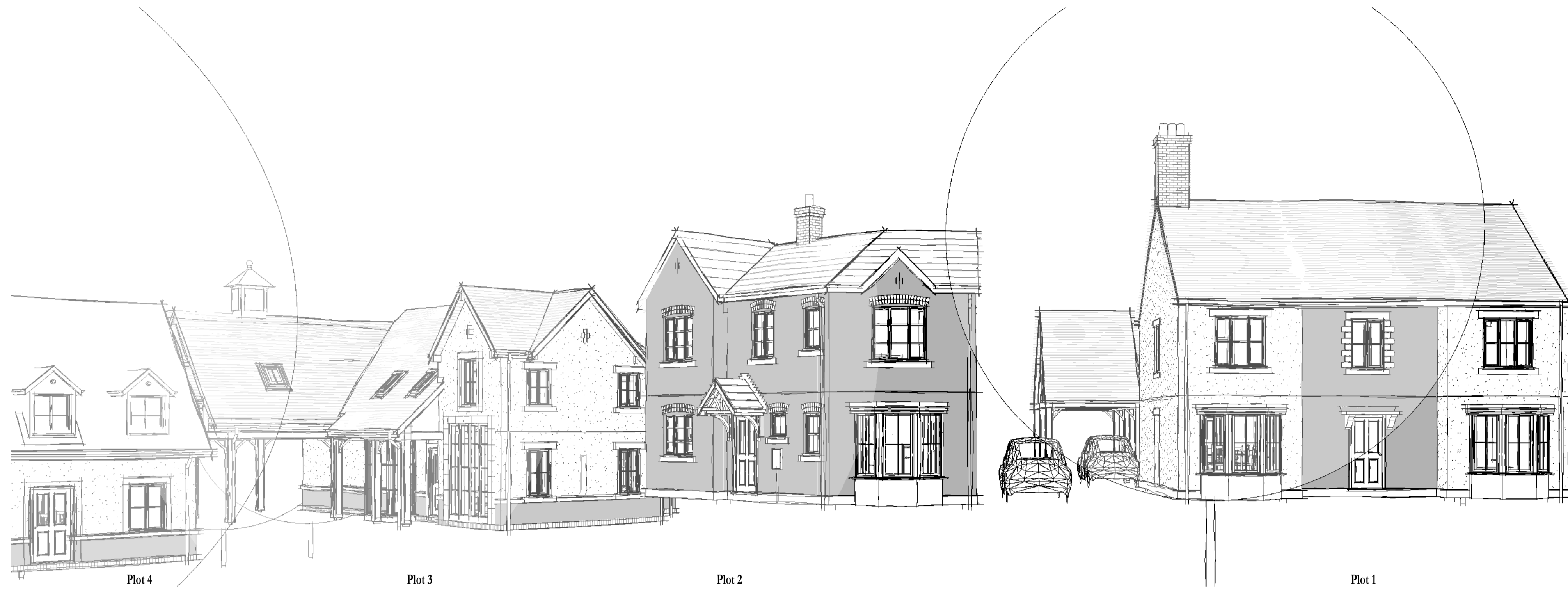
Plot 4 Plot 3 Plot 2 Plot 1 Proposed Indicative Sketch Perspective View 1