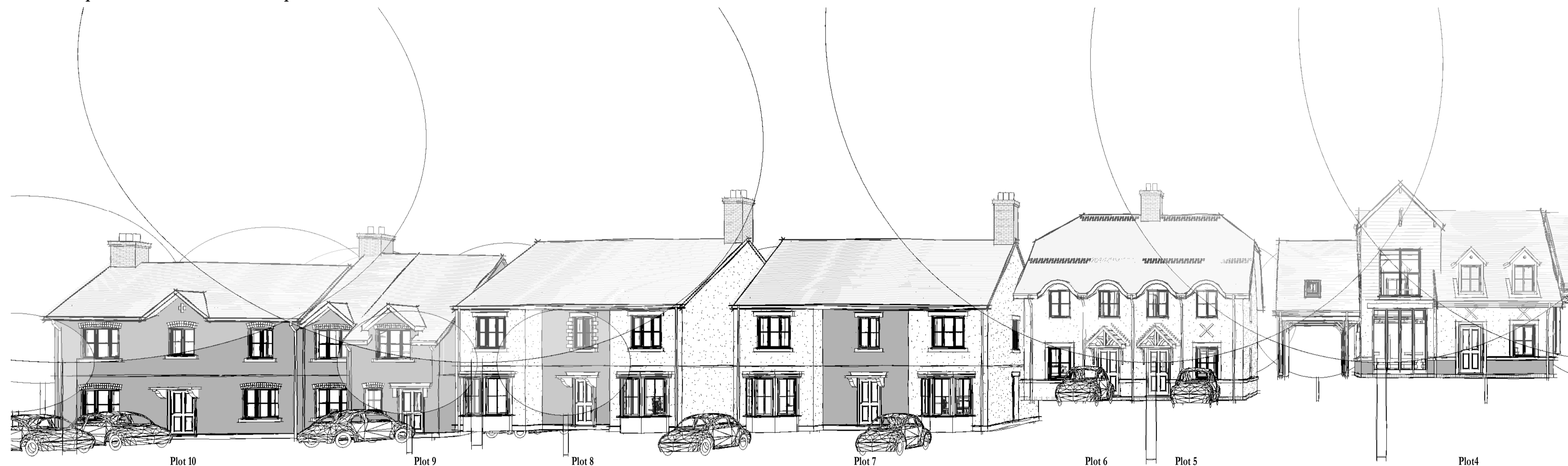
Plot 10 Plot 9 Plot 8 Plot 7 Plot 6 Plot 5 Plot 4 Proposed Indicative Sketch Perspective View 2