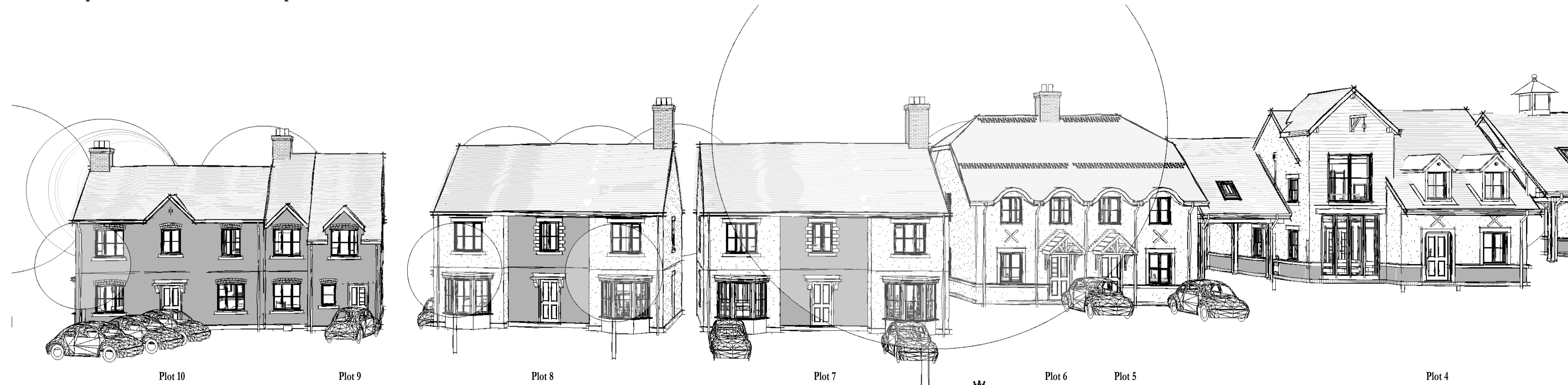
Plot 10 Plot 9 Plot 8 Plot 7 Plot 6 Plot 5 Plot 4 Proposed Indicative Sketch Perspective View 3